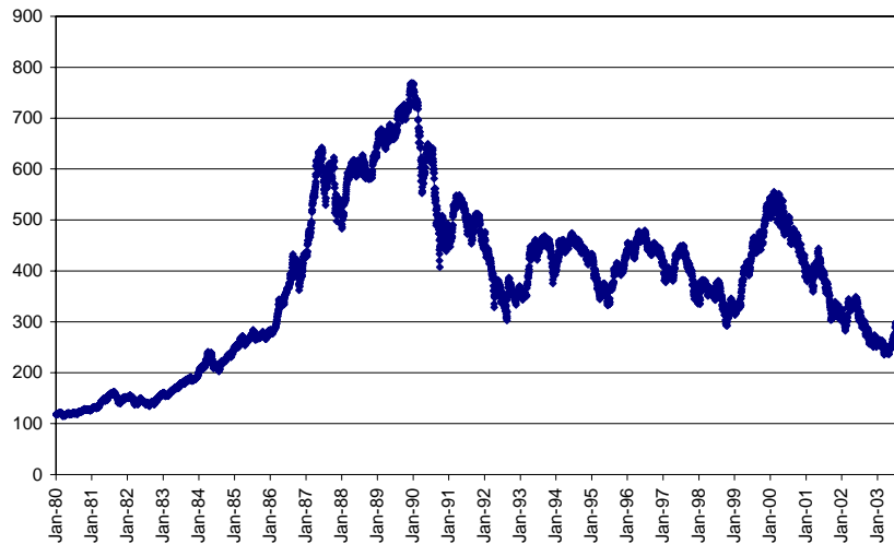
Figure 2 Market index in Japan from January 1, 1980 to November 5, 2003

2003. The market index went up from around 250 in 1985 to the peak 780 in 1990 and staggered up and down from 1996 to 2002. It is obvious that investors in Japan before 1991 were strongly optimistic about the equity market. The convertible bonds issuance provides the opportunity to convert the debt into equity in the future. So the market in Japan reacted positively to the announcement of CBs issuance before 1991. During the period from 1996 to 2002, the up and down stock market performance had shaken the optimism of the investors. The probability that the CBs issuance conveys unfavorable information caused the negative stock reaction. The results indicate the consistency to the “bubble economy effect” hypothesis, which has been rejected by Kang and Stulz (1996).